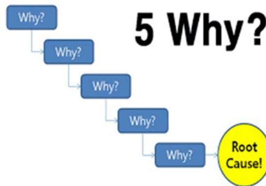
Figure 1. 5 Why-Analysis

This method was first developed by Sakichi Toyoda in 1930 when solving a problem at his company (Widyasari, Setiawan, & Perdanakusuma, 2019). This analysis is done by asking questions that begin with “why?” until the question is repeated to find out and solve the problem at hand (Kepner-Tregoe, 2020). Due to the nature of this method, it is simple and effective to trace the root causes of issues to produce preventive actions so that these problems do not recur (Rumaysha, Rachmadi, & Setiawan, 2017).