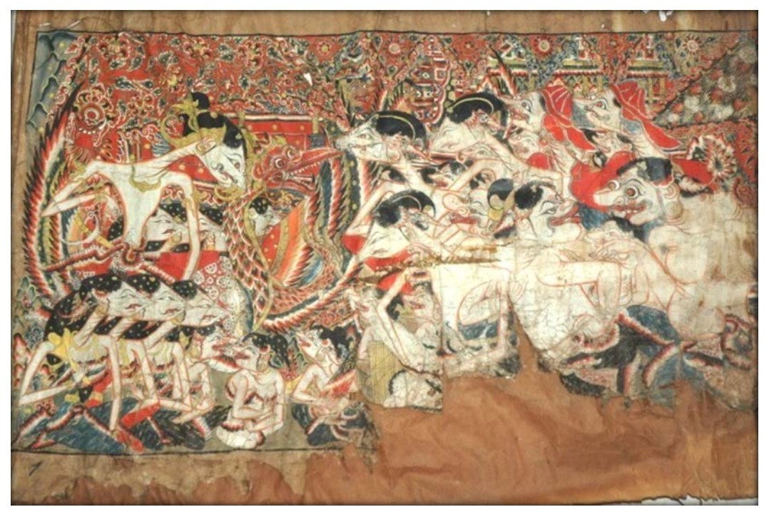
Figure 2. King Brawijaya held a meeting with the royal courtiers to discuss the disappearance of Dewi Sekartaji and hold a contest.

Not long after that, there was a young man who turned to the king of Kediri to join the contest. The young man was very powerful. The supernatural power was shown by defeating a bull in the Kediri square. The king was amazed to see the youth's supernatural power, then asked the young man's background to Patih Arya Deksa. Patih informed him that the young man was named Jaka Kembang Kuning. He came from Kademangan Kuning and became a messenger of Ki Demang Kuning.