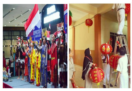
Figure 2. One form of multicultural activity

Day, Vesak Day, Chinese New Year, Hijri New Year, Dewapali.