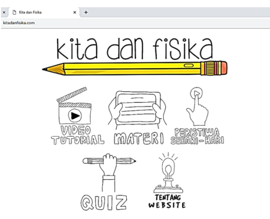
Figure 1. Screenshot of Website Home

physics websites that contain several menus such as: tutorial videos, material, daily events and quizzes. Media validation was carried out by two experts, the first was a media expert, the other was the expert in the field of natural sciences. The website used as a learning media can accessed at www.kitadanfisika.com . Website screenshot can be seen in Figure 1 and a screenshot of the tutorial video in Figure 2.