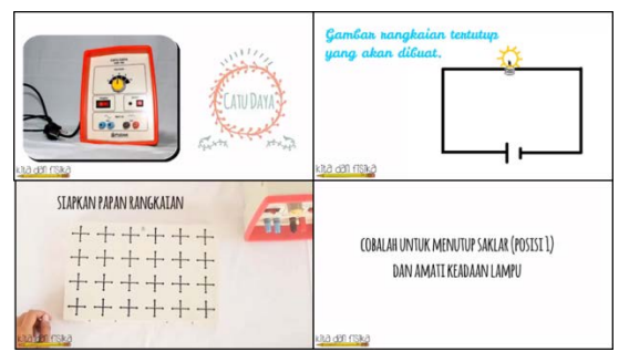
Figure 2. Screenshot of Practicum Tutorial Videos

The science process skills that are tested are tailored to the science process skills that are developed when carrying out the learning and planned in the learning method. The aspects of the science process skills developed at the time of learning only cover four aspects of process skills including: interpreting, communicating, applying concepts, and planning research. The reason for choosing aspects of science process skills only covers the four aspects above because the four aspects are in accordance with the concept being taught.