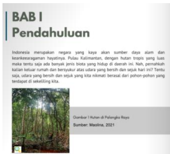
Figure 1. Image display of peat forest in Palangka Raya, Central Kalimantan

The e-book is equipped with supporting components in the form of: “Info at a glance,” which displays trivia related to learning materials and information related to peat ecosystems; “Student activity” is a topic of discussion and practicum for students; The “information corner” displays a YouTube video link in the form of an SSI on peat ecosystems and the impact of global warming (Figure 2). 3. The interactive feature can provide an exciting learning experience with multimedia that can be accessed directly through offline or online e-books.