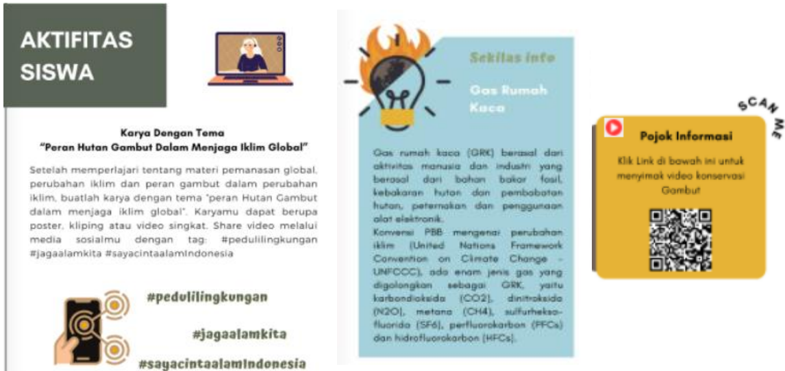
Figure 2. Additional components in interactive e-books

The interactive features in the e-book are 1. the display of the book that can be flipped like a printed book; 2. Zoom button to enlarge the view of pages and photos; 4. Play button in