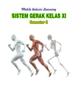
Figure 1. cover page in mobile learning media (mobile MOTION).

Cover page (splash screen), on the splash screen there is the title of the material, the UNNES logo, the target user and the next button to go to the next page. The following is an image of the cover page in mobile learning media.