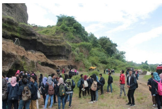
Figure 3. Excursion Discovery Learning

As the definition of geological processes, the discovery of geological hazards definition is also an example of more complex question compared to discovering the definition of metamorphic rocks and sedimentary rocks. The discovery and understanding of this definition requires higher knowledge. This understanding is also important to assist the students having deeper knowledge about environmental geology for urban and regional planning. This question not only requires the ability to find the answer to simple as through reading and observation but also deeper understanding on the material. The distribution of respondents' answers can be seen in the following table.