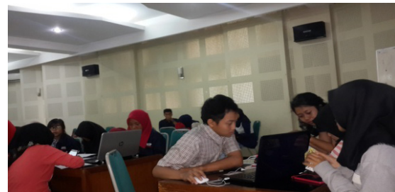
Figure 2. Small Group Discussion

ing methods should be directed to the effort of finding the definition of the geological processes through group task or field trips.