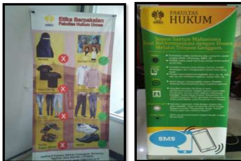
Figure 4, Figure 5. Examples of Ethical Policy (Communication and Attitude Policy)

In addition to the preventive control that has been applied by the faculty, in the form of exhibitors and display of words that are positive, it is good that the lecturer gives a good example to students, becoming role models for students. This is the same as stated by Aprila Naravita, as Secretary of the Collaborative Development Cluster, PKL and KKL who provide an explanation that there must be role models in this lecturer, because it is useless to be socialized loudly but not balanced with good role models. from the lecturer.