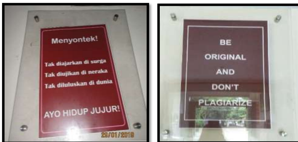
Figure 2, Figure 3. Examples of Ethical Policy in Faculty of Law UNNES