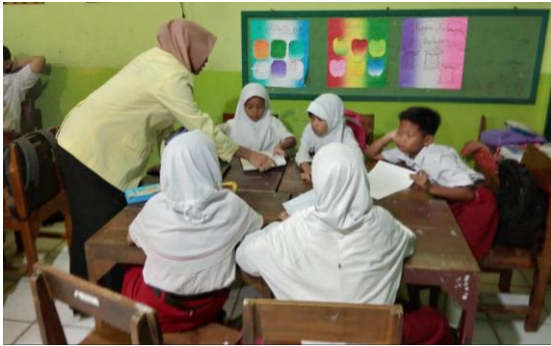
Figure 2. Organizing Students to Solve Problems on Student Worksheets