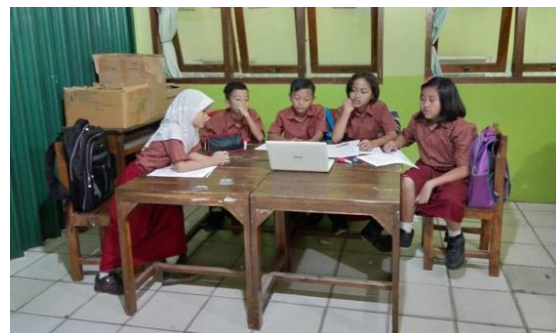
Figure 1. Student Orientation Towards the Problems Contained in the Student Worksheet

Interactive video-assisted Problem Based Learning (PBL) learning models effectively improve students' problem-solving. This increase can be seen from the results of the study as follows.