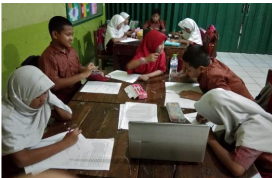
Figure 3. Group Investigation Activities