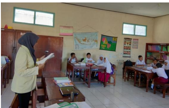
Figure 5. Analyzing and Evaluating the Results of the Discussion