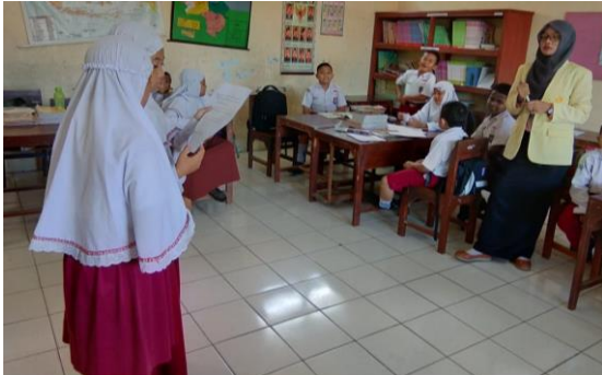
Figure 4. The Activity Presents the Results of Group Discussion