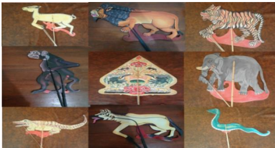
Figure 3. Wayang Kancil

The wayang kancil with several animal characters as well as gunungang (mountain characters) as the symbol of the Rimbaraya forest can be seen in Figure 3.