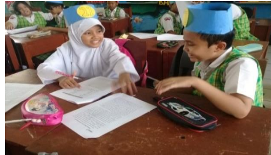
Figure 2. Paired Storytelling

In the paired storytelling technique, the students work with the students in the atmosphere of mutual cooperation and have many opportunities for processing information and enhance the communication skill (the activities of reading, writing, listening, and speaking). It can assist students in understanding the democracy concept (mutual acceptance, living together in differences, respect for others, responsibility, and being fair). The students are telling the story in pair can be seen in Figure 2.