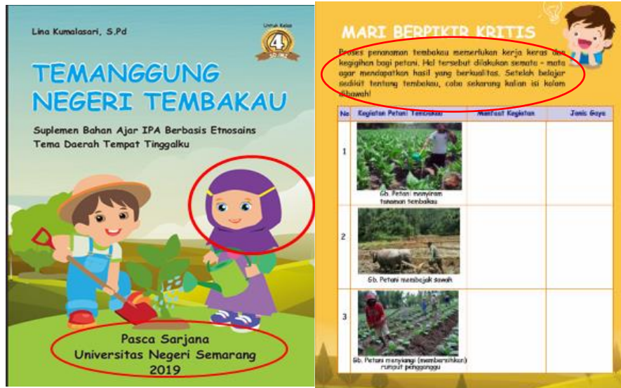
Figure 1. (a) The Front Page After The Revision, (b) The Material Let's Think Critically After Revision

Besides, the revision of the draft teaching material, the test instrument used in the evaluation is improved before the questioned validity is tested. Siallagan et al. (2016) state that good types of questions are questions that guide students to find their answers, so between one