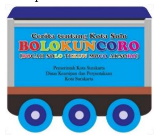
Figure 2. Bolokuncoro Book Design

1. The initial display of Bolokuncoro book before development: