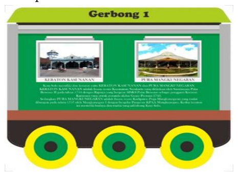
Figure 4. Bolokuncoro Book Carriages

3. The form of Bolokuncoro book before development