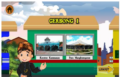
Figure 5. Carriages After Development

4. The form of media after being developed