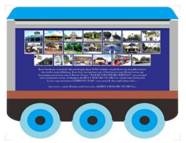
Figure 6. Bolokuncoro Book

The form of Bolokuncoro book before added with the development of games is as in Figure 6.