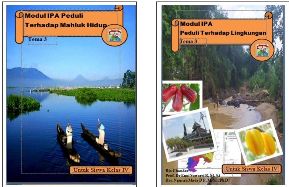
Figure 2a. Cover Before-After Repaired