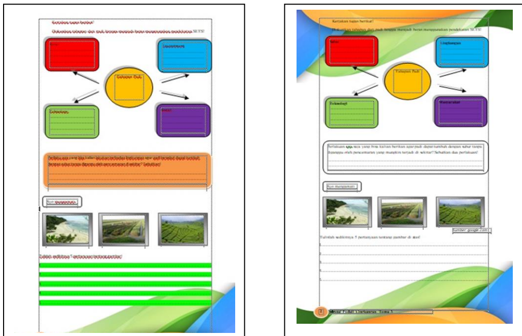
Figure 2b. Color Before-After Repaired

In addition to the module, there is a test observation sheet, and a validator has validated a questionnaire. Each of them gets a valid category, so it can already be used for limited trials. The next step is an instrument that has been validated by an expert validator who