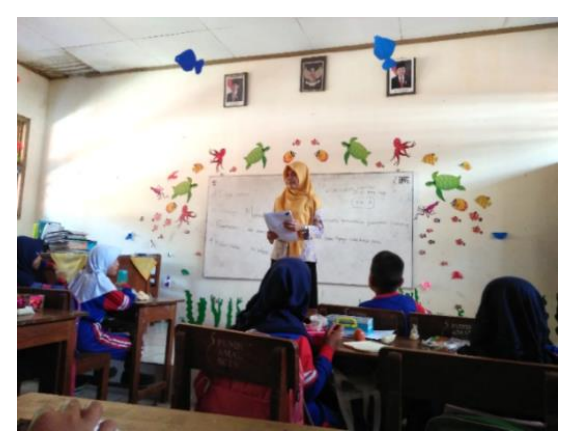
Figure 2. Question Steps

students towards the material being studied. Students try to explore the material with previous knowledge. Class B, C, and D students have high enthusiasm for this step. Students' attention is able to focus on the explanations and directions given. Meanwhile, in Class A students do not really focus on the material given. The results of the survey measures as an introduction for students to go to the next step which is a step question. In the question step, it teacher gives students questions about discourse and students and researchers shown in Figure 2.