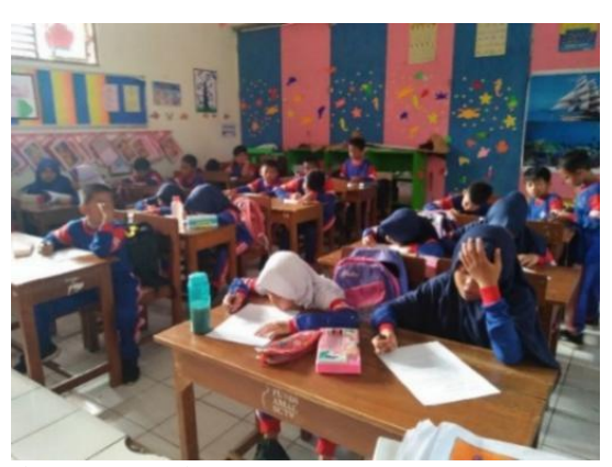
Figure 3. Read step

answering questions related to the material provided, while female students are more focused on teaching material. After students ask various questions related to discourse, the next step is to instruct students to read the entire discourse carefully. This reading step is shown in Figure 3.