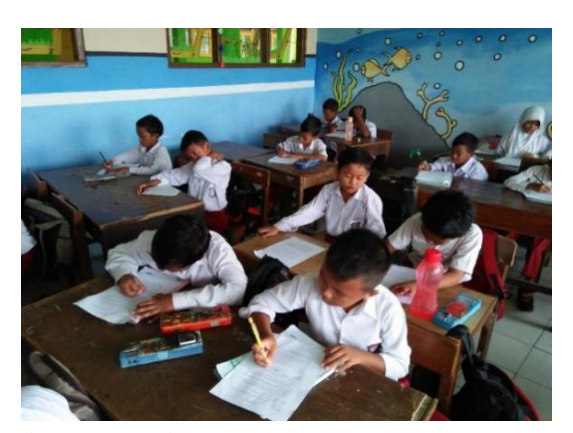
Figure 6. Review steps

The results of observations in class A show that all students have not shown the courage to explain the answers they get, so that encouragement is needed to stimulate students' courage in communicating. In class B students could described the results of the correct answer, while in class A student communication still be established better. In Classes C and D, students to follow this step and actively provide the answers they get. The results of the various learning steps carried out ended with student activities providing material reviews through the review steps in Figure 6.