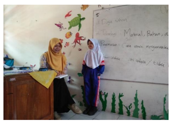
Figure 5. Step Recite

The steps to reflect in Figure 4 show the activities that occur when students have the opportunity to exchange all the information they find while reading with the knowledge they have. In this step students were encouraged to connect with the knowledge gained by looking for examples of students in everyday life. The results of this information relate to the knowledge that students should be encouraged to understand. The observations made in classes A, B, C, and D at this step were successful. Students can exchange various knowledge related to the topic being taught. Furthermore, students were instructed to think in answering the questions that have been arranged in the question step through the recite step. In this step the students were present various information once more. So that at the end of the step students were able to communicate the subject matter presented as in Figure 5.