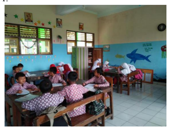
Figure 1. Survey Steps

The implementation of the content language integrated learning approach in third grade Elementary Schools is realized by planning, processes, and results. At the planning stage, the design of CLIL Morgado (2018) was adjusted by considering the contents (material content), skills to be trained, learning media, task planning, and evaluation. Then, implementation is carried out by entering the stages of the SQ4R learning model (investigation, questions, reading, reading, recording, review). In investigating, students are provided with topics that are suitable for learning in the form of textual discourse and asked them to read carefully as shown in Figure