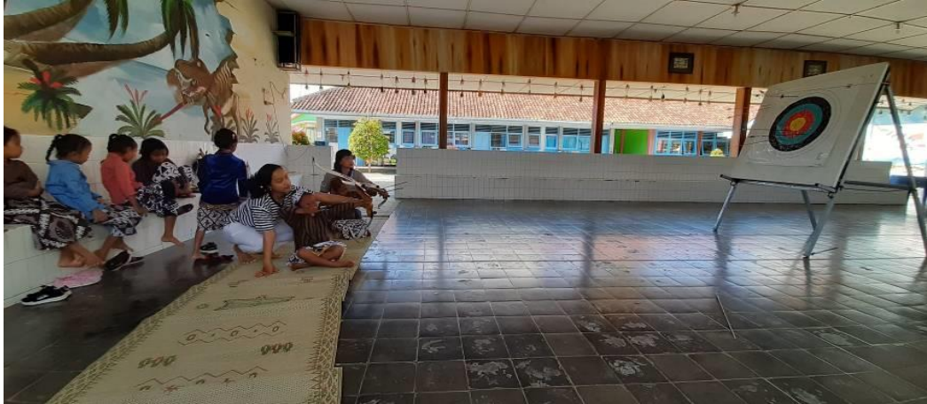
Figure 2. Jemparingan activity accompanied by the trainer

replaced using archery boards or targets commonly used in modern archery. Besides, not all of the bow and arrow positions can be practiced right in front of the chest like jemparingan sports in general because some children are not yet strong enough to hold the bow in front of the chest to reach the target.