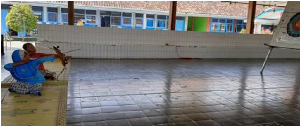
Figure 1. Jemparingan game activities at Pembina Wates State

Figure 1 describes the jemparingan game activity carried out by the Pembina Wates State Kindergarten, Kulon Progo Regency, Yogyakarta