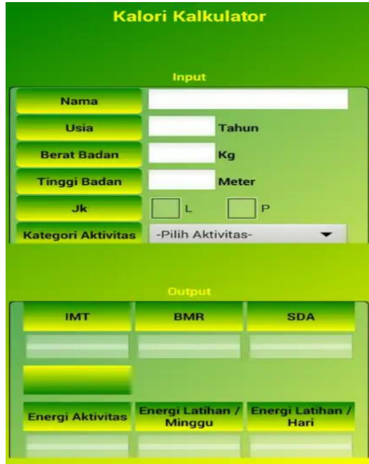
Figure 4. Interface Calculations of Energy

On the calculator page of energy needs there are some menus. The input menu that must be filled by the user that is: Name, Age, Weight, Height in meters, Gender, Category of Activities