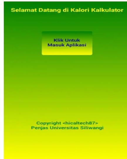
Figure 2. Interface Home

On the home page there is a menu to enter the application.