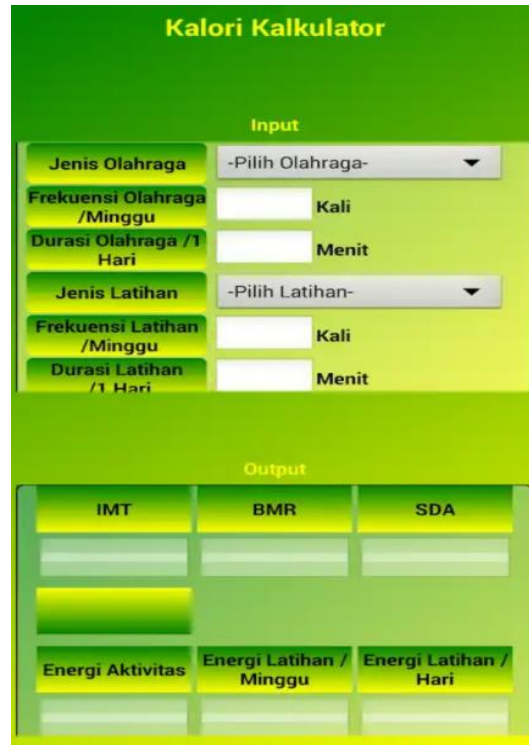
Figure 5. Interface Calculations of Energy

On the activity calculator page there are several menus: Process menu, Delete menu, Menu Output that will provide information on the results of the data input, namely: Energy Activity, Energy Exercise/Week, Energy Exercise/Day Total Energy Requirement/Day. (Figure 6)