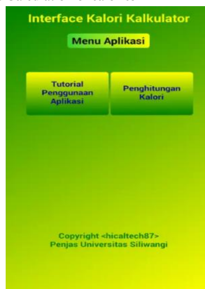
Figure 3. Interface Menu