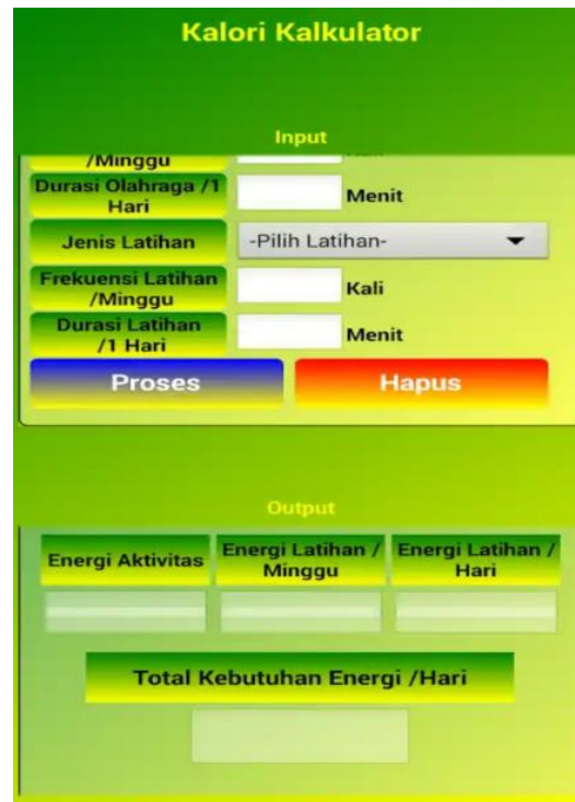
Figure 6. Page Calculator Activity Interface