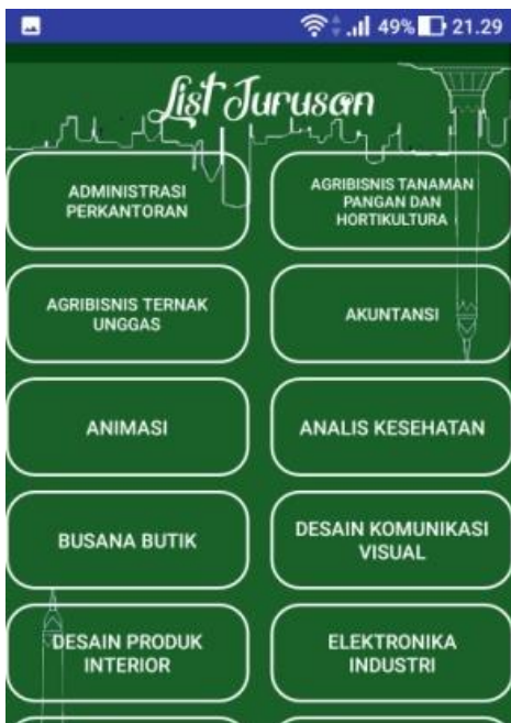
Picture 2. Display The Contents of The Majors List