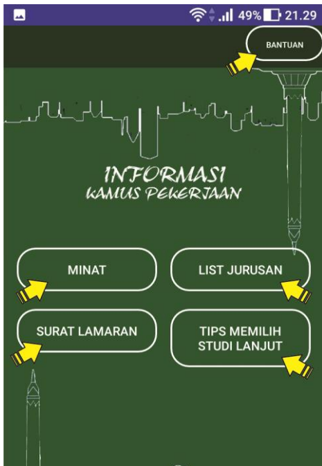
Picture 1. Content View

such as picture 1,2,3 which has been adjusted to the development of students,