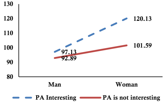
Picture 2. Graph of Physical Attractiveness and Gender on Self Disclosure

accessed by others in direct interpersonal interactions (Abel, Croysdale, and Stiles, 2009).