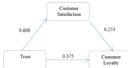
Figure 3. Path Analysis Trust on Customer Loyalty toward Customer Satisfaction

The following is a figure track analysis to prove the mediation effect of customer satisfaction variables on the influence of trust on customer loyalty