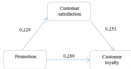
Figure 2. Path Analysis Promotion on Customer Loyalty toward Customer Satisfaction

The following is a drawing track analysis to prove the mediation effect of customer satisfaction variables on the influence of promotion to customer loyalty: