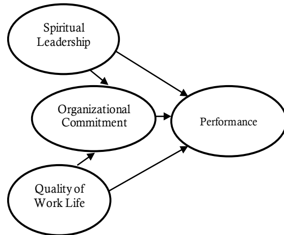
Figure 1. Research Model

Based on the development of hypotheses the following research models can be formed: