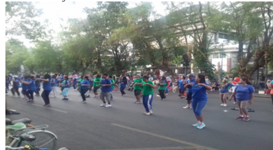
Picture 2. Spirit and enthusiasm of Aerobic Gymnastics at Lotte Mart Morning Gymnastic Community

Every aerobic gymnast in the community has an underlying motivation so they are willing to participate in aerobic exercise. Data collected through the results Questionnaire, interview on gymnastics participants, then analyzed using descriptive percentage. The results are illustrated and found what