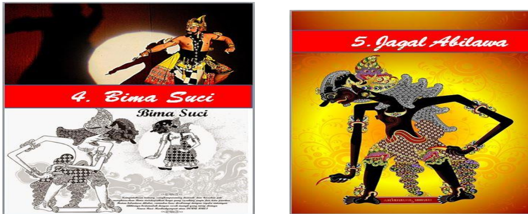
Figure 5. border cover chapter 4 & 5 'Bima Suci' and 'Jagal Abilawa'

(6) The Pandhu Swarga plays told the struggles and devotion of the Pandavas especially the Bima figure to pray for his parents namely Prabu Pandu and Dewi Madrim who were sentenced in the crater of hell. Pandu and Madrim who received punishment after killing Begawan Kimindama ascetic during sexual