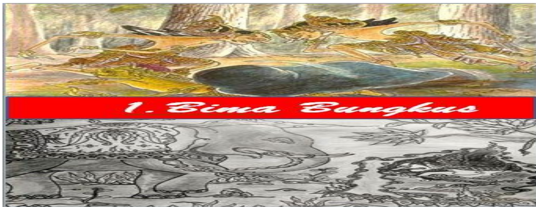
Figure 2. border cover chapter 1 'Bima Bungkus'

Dewanata deliberately placed Bima, which was still in the form of a wrapper in the middle of the forest, as a means to be concerned so that one day he would become the main knight. These efforts were once constrained by Kurawa who was not happy with Bima's birth, even though Bima finally passed the test.