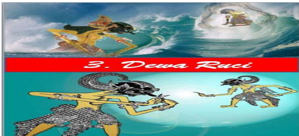
Figure 4. border cover chapter 3 'Dewa Ruci'

very hard struggle must be passed by Bima starting from entering the forest, going up the mountain to dive into the ocean floor. With perseverance and sincerity, Bima managed to meet with Dewa Ruci.