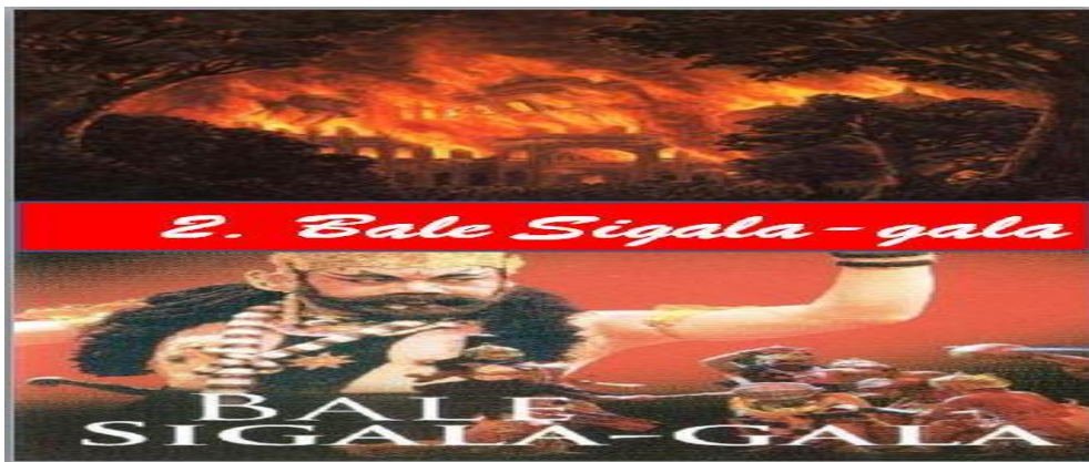
Figure 3. border cover chapter 2 'Bale Sigala-gala'

(3) Dewa Ruci play telling the story of Bima's struggle to find a true teacher to meet Dewa Ruci at the bottom of the ocean. Bima who wanted to explore Manunggaling Kawula Gusti knowledge and then met Durna's teacher. A