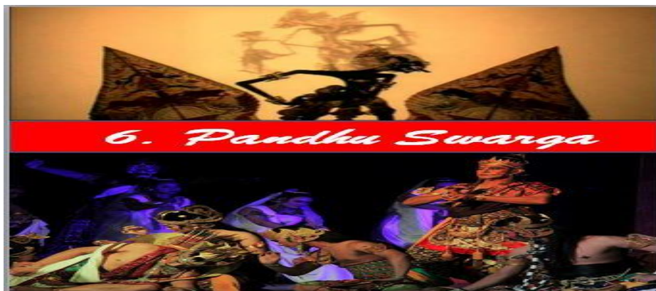
Figure 6. border cover chapter 6 'Pandhu Swarga'

intercourse, were punished by Dewa and put in the crater of Candradimuka . This made Bima and the Pandavas not accepted and tried to pray for his parents to enter Swarga. Various obstacles and trials had to be passed by Bima until finally he was able to touch his parents.