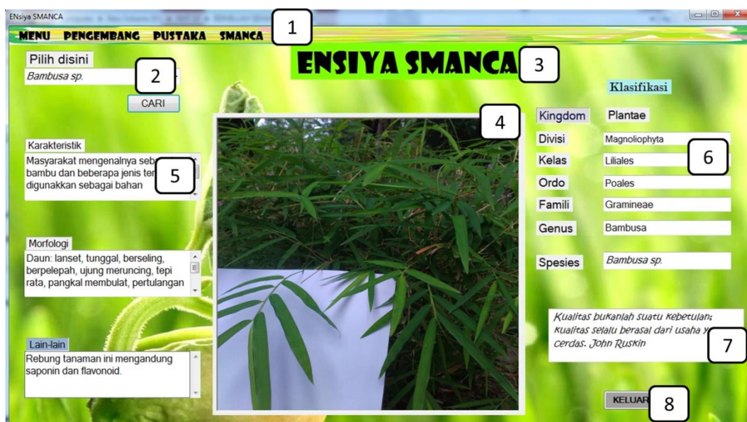
Figure 2 Display Encyclopedia Main Content Final Revision Results. (1) Sub Menu; (2) Search Box; (3) Information Box; (4) Picture Box; (5) Classification Box; (6) Motivation Box; (7) Command Box.

Test Results small-scale tryout found the poor assessments of students. Students think the font used was less clear and the word motivation must be multiplied. Ensiya Encyclopedia is considered interesting because all this time students don't understand much about what species are around. The font was changed to 14 pt making it easier to read. Encyclopedia view after final revision can be presented in Figure 2.