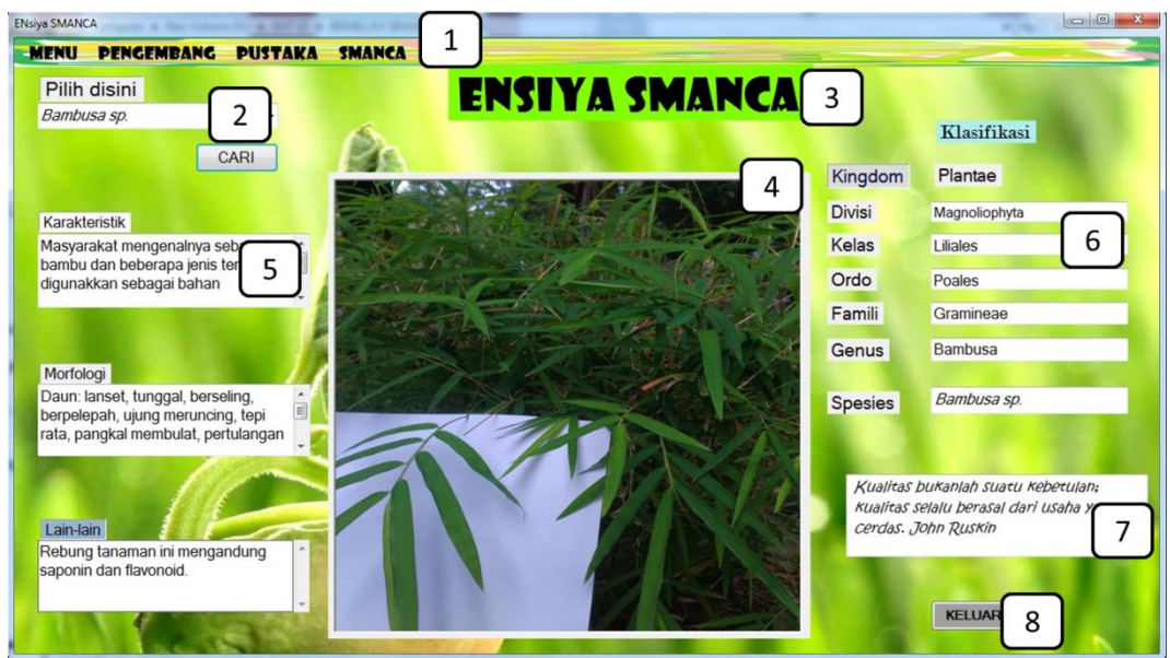
Figure 2 Display Encyclopedia Main Content Final Revision Results. (1) Sub Menu; (2) Search Box; (3) Information Box; (4) Picture Box; (5) Classification Box; (6) Motivation Box; (7) Command Box.

Test Results small-scale tryout found the poor assessments of students. Students think the font used was less clear and the word motivation must be multiplied. Ensiya Encyclopedia is considered interesting because all this time students don't understand much about what species are around. The font was changed to 14 pt making it easier to read. Encyclopedia view after final revision can be presented in Figure 2.