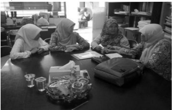
Figure 2 The planning phase in cycle I

that predict the student's response, anticipate and provide students with a necessary assistant. The model lecturer prepared any equipment for instructional activities in the classroom. Meanwhile, the observers do observation during the learning process. Each of the observers noted what the students were learning into the observation sheet for fulfilling the need of coming to see phase in cycle I.