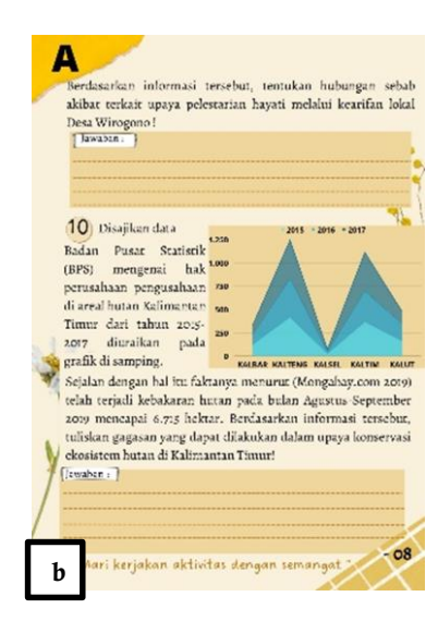
Figure 2 Profile of E-Quiz based on liveworksheets for biodiversity topic which display the stimulus question to train higher order thinking: a) sample question display with image and video stimulus and b) example of question display with graphic stimulus.

A limited trial recapitulation was obyained to analyze the empirical validity, reliability and practicality tests of the developed of E-Quiz media. The purpose of the analysis of the empirical validity of the E-Quiz questions is to find out whether it is valid or invalid after being tested on a limited trial (Rini and Budijastuti, 2022).