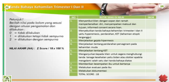
Figure 5. Checklists of danger signs in Trimester I and II