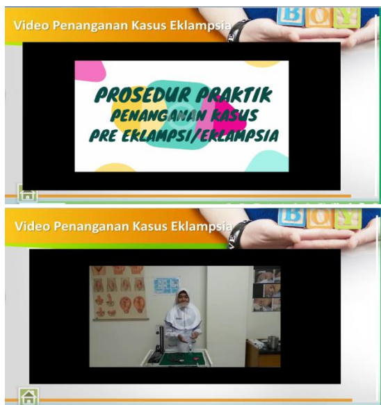
Figure 6. Video appearance

Outcome of e-modul this figure 1 Main menu appearance is pregnancy care e-modul “Deteksi kegawatdaruratan maternal “ to DIII midwife student’s, detailed appearance of the table of Contents of figure 2 consists of learning objective, theory and evaluation. Figure 3 this Pregnancy care content appearance of various case explanation, other that figure 4 Checklists of danger signs in Trimester I and II to knowledge procedure practice, than figure 5 Video appearance so giving provide student stimulation. This final pregnancy care e-modul figure 6 is profile appearance contains author.