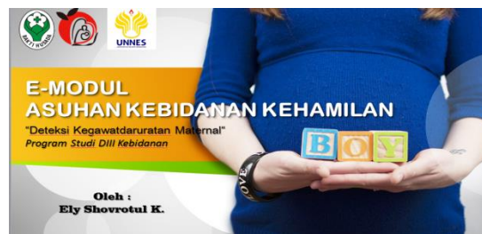
Figure 2. Main menu appearance

The Final Product (capture) of 3D Pageflip Professional pregnancy care e-module is as follows: