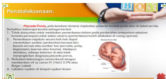
Figure 4. Pregnancy care content appearance