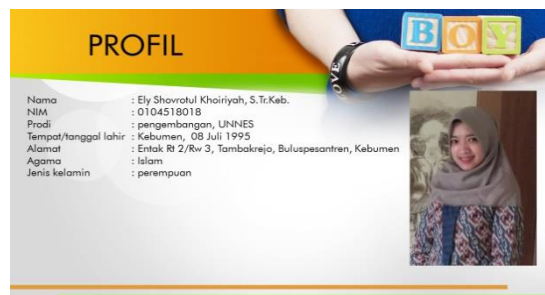
Figure 7. Profile Appearance