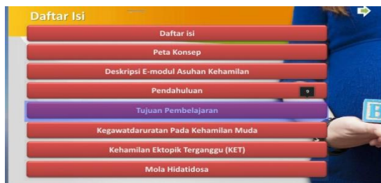
Figure 3. Detailed Appearance Of The Table Of Contents