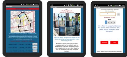
Figure 1. App interfaces (Map: ©OpenStreetMap contributors)

designing the trails, it is also necessary to consider several factors such as: safety, comfort, duration, distance, and accessibility for teachers who would observe and supervise all student activity.