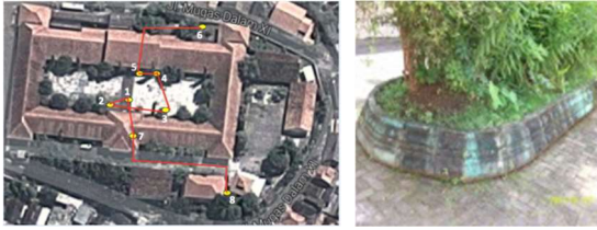
Figure 3. (a) SMP 10 math trail route; (b) The Toga Garden Task

With the help of GPS feature and photos displayed in the app, users can find this object, then they get a problem: "Calculate the area of the grass field. Give the result in m^2 !" To solve this problem, students must identify the shape of the grass field, then look for the concept in mathematics accordingly. Some groups have difficulty when it comes to determining what formulas can be used to calculate the area. The role of mobile app in this situation is to offer help if users need it. The first aid is to invite students to think about how students use the mathematical concepts they have learned in class to solve the real problem. First Hint is "Divide the area into shapes you know". The purpose of this hint is to direct students to acquire geometric shapes, for example: a rectangle and two semicircles.