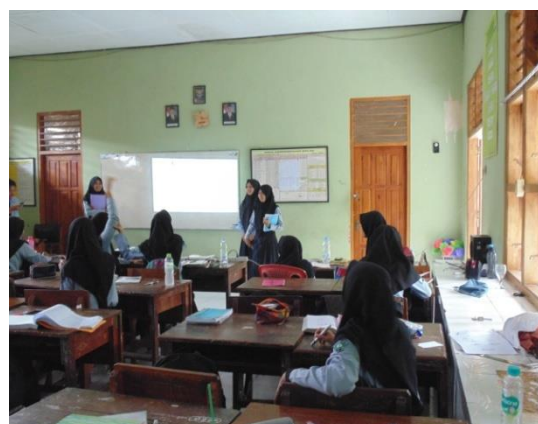
Figure 3. Students' Questions and Answer