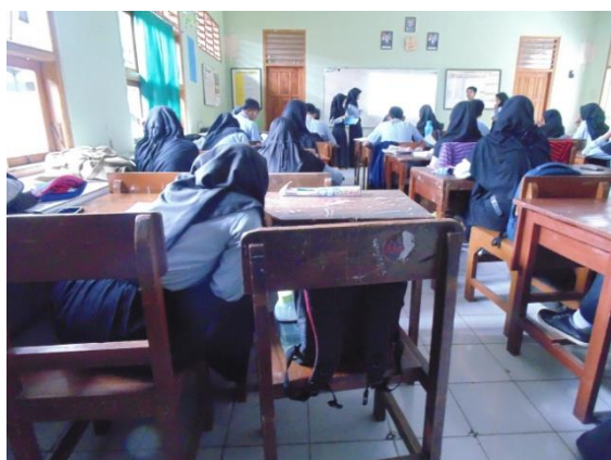
Figure 2. Group Presentation

Beside the analysis of observation, the documentation also shows students activity which can be included as empowering and improving their communication skills. Those activities can be seen in Figure 2 and 3.