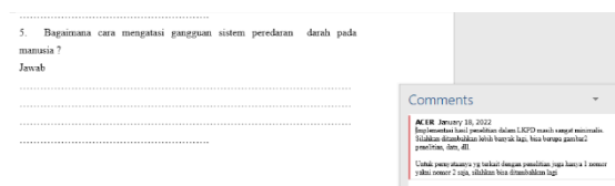
Figure 7. Review aspects of using LKPD in learning

The input above is related to sentences that are less standard in a question and may create a misconception between what the teacher asks the students.