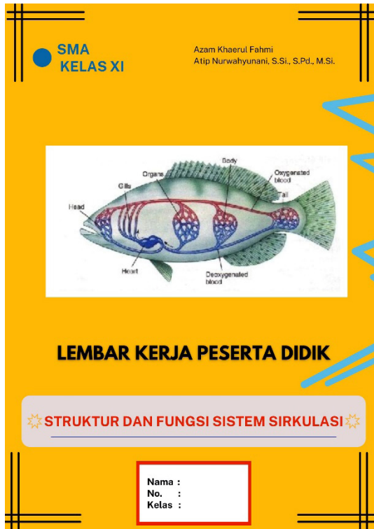
Figure 1. LKPD Cover

The cover design above generally meets the criteria, where there is already a LKPD title so that it is easily recognized by students, a picture of the circulation of fish blood which is expected to be able to clarify the intent, purpose, content and discussion of the material from the LKPD, there are also class targets who take the material and the authors or compilers of the contents of the LKPD. When designing a cover, we are required to create an interesting creativity, cover design can be in the form of photography, typography (letter design), illustration images or it can be a combination of all these elements. The cover design must be specific to the LKPD concept or other tools so that students can easily recognize and be interested in reading it (Widyokusumo, 2012)