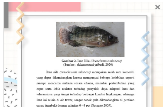
Figure 2. Examples of pictures in LKPD taken from research

or so on is intended to avoid copyright infringement or piracy. It must be admitted that adding photos and images will make scientific work that was previously uninteresting become more interesting. Rigid scientific work will blend well with the added images and photos. Because these photos and images are flexible, easy to understand. A good picture for LKPD is one that can convey the message/content of the picture effectively to LKPD users. (Umbaryati, 2016)